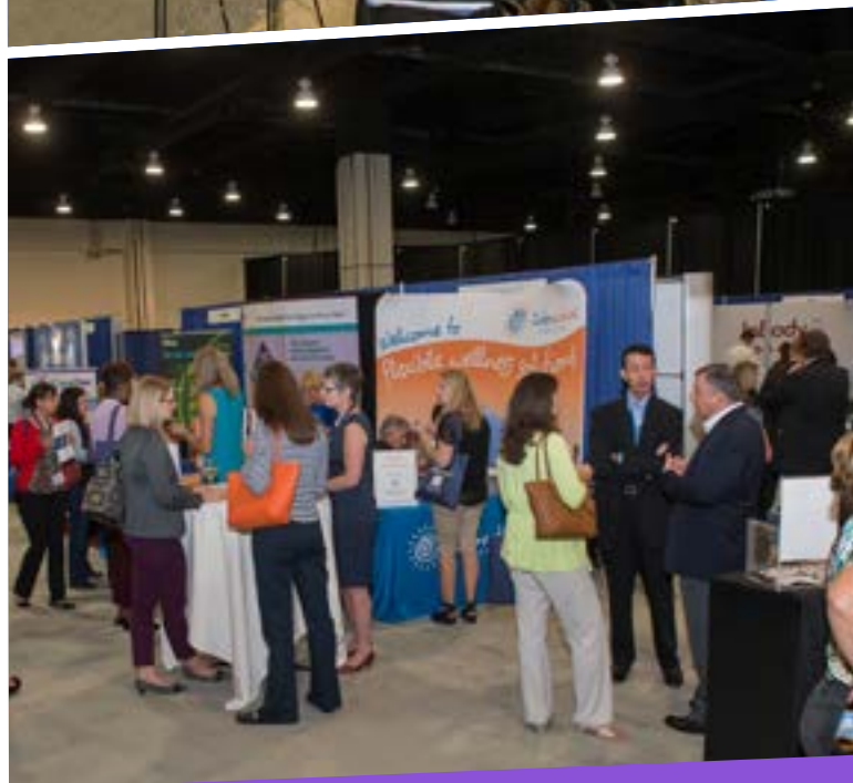
EXHIBIT HALL SPONSORSHIP & OPPORTUNITIES