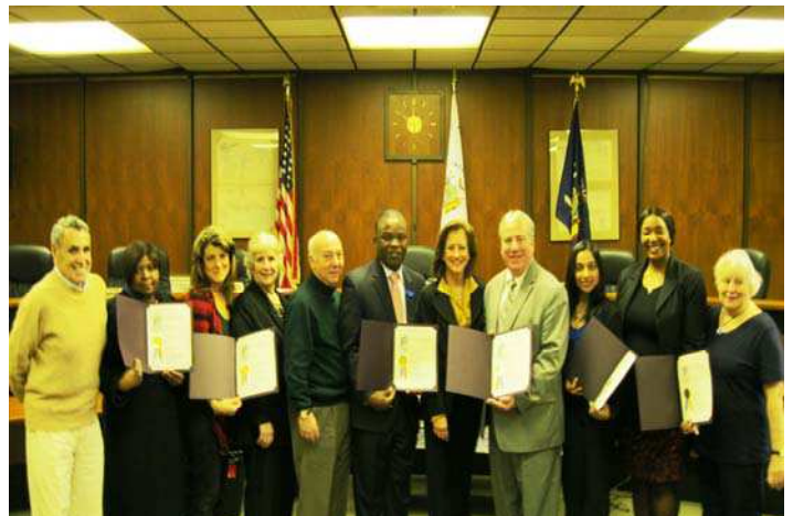
Village of Great Neck Plaza Star Performers with their nominators on February 2, 2012

We would like to thank our Star Performers for going above and beyond to help the people of Great Neck.