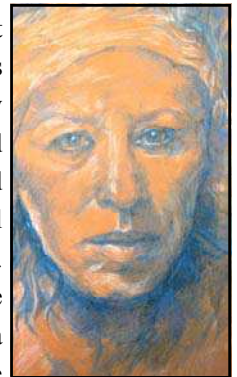
"By the Door" - Self Portrait