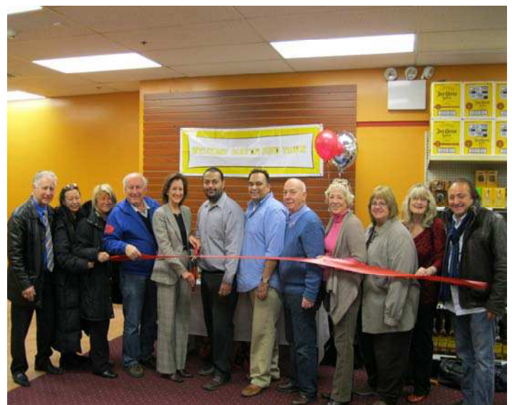
A recent ribbon cutting event welcoming Fine Wines and Liquors to the Plaza