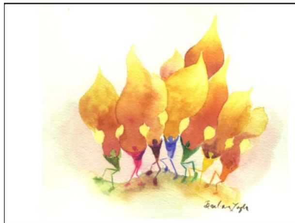
Card Design: FLAME