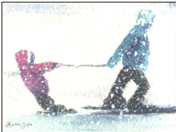
Card Design: SNOW

732-246-8060 x123 events@preventchildabusejnj.org