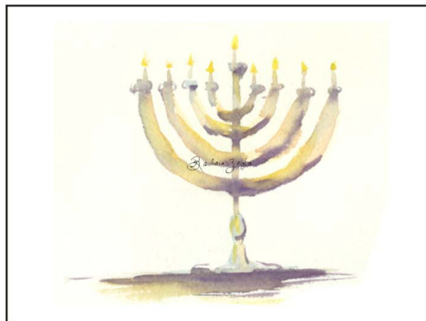
Card Design: MNH

Visit www.preventchildabusejnj.org/cards for closer view of artwork