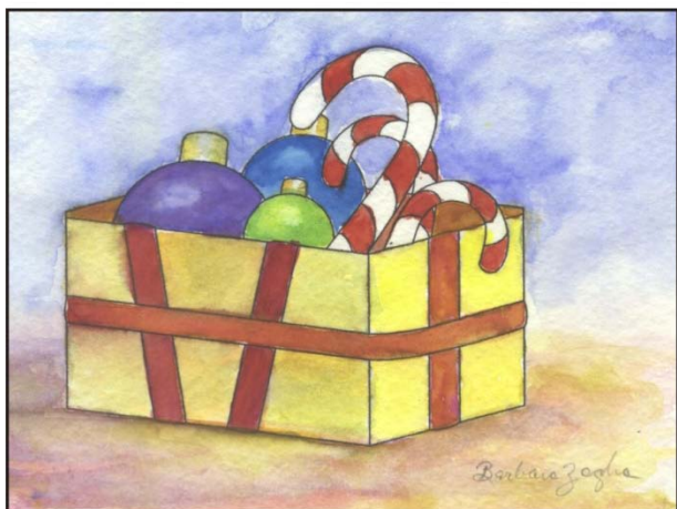
Card Design: GFT