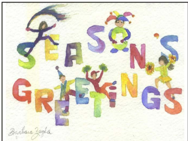
Card Design: SG1