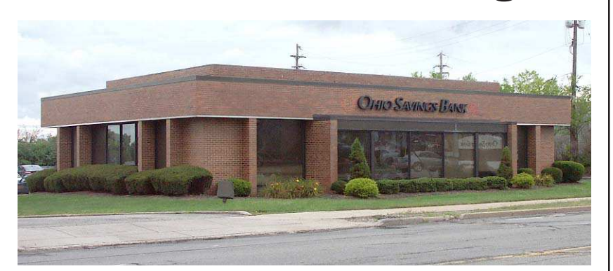
An attempted robbery at the Ohio Savings Bank in Garfield Heights led to charges being filed against two men last Saturday morning.