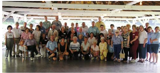
Alumni Group Picture, August 2009

As a reminder, the Alumni Association operates on a Fiscal Year, July to June. Memberships are now being accepted for 09-10. Please use the above application for membership renewal. If you have any questions, feel free to contact the Alumni Association at 533-5601 x 1001 or e-mail alumni@gjhsd.net