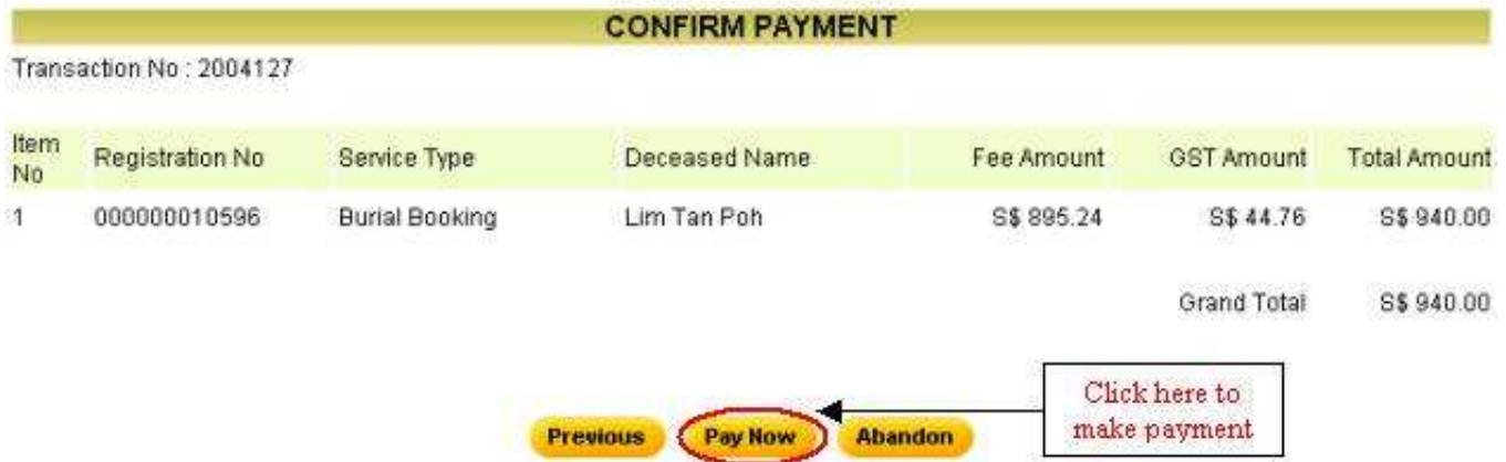
Diagram 10. Confirm Payment page.