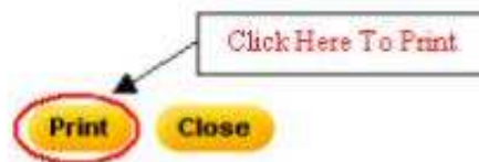
Diagram 12. Acknowledgement of payment.

PSi Ref. No : 332d46b93b2e01cc-25102004-11277-1284763411 EP Ref. No :- PSi RN : NEA0000000019447