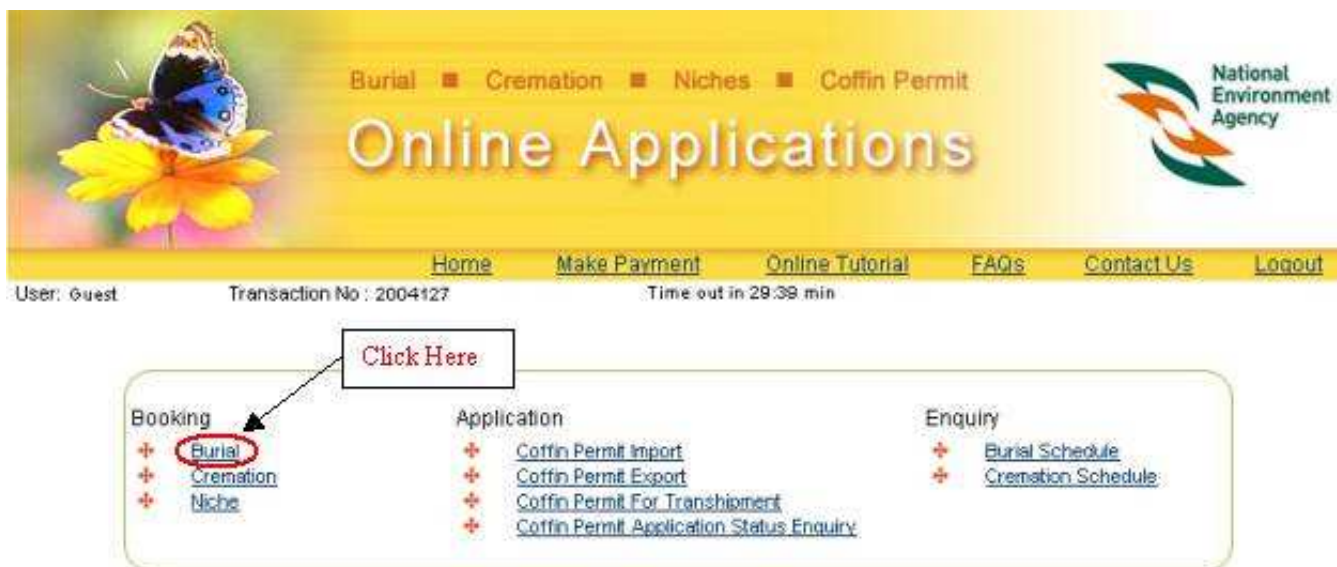
Diagram 1. Homepage for Public User

Choose “Burial” (As shown in Diagram 1) if you wish to make a burial booking.