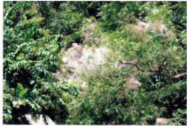
Webworms: A Fall Menace