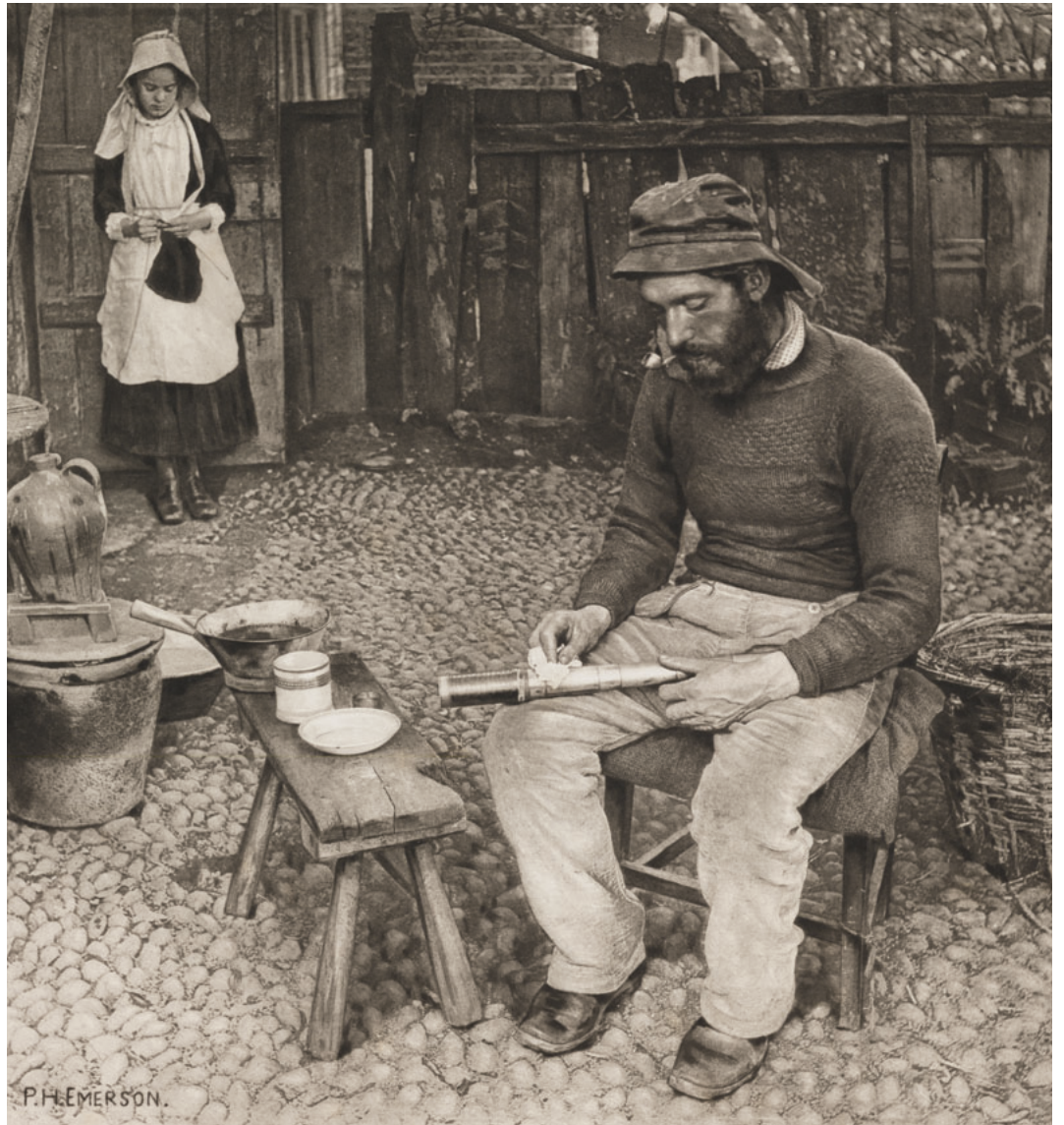
Peter Henry Emerson (British, 1856–1936)

This exhibition was organized by the National Media Museum in Bradford, England and printed in collaboration with the Norfolk Sister Cities Program.