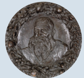
Pierre Auguste Renoir (French, 1841–1919) Claude Monet , 1916–17 Gift of Walter P. Chrysler, Jr.