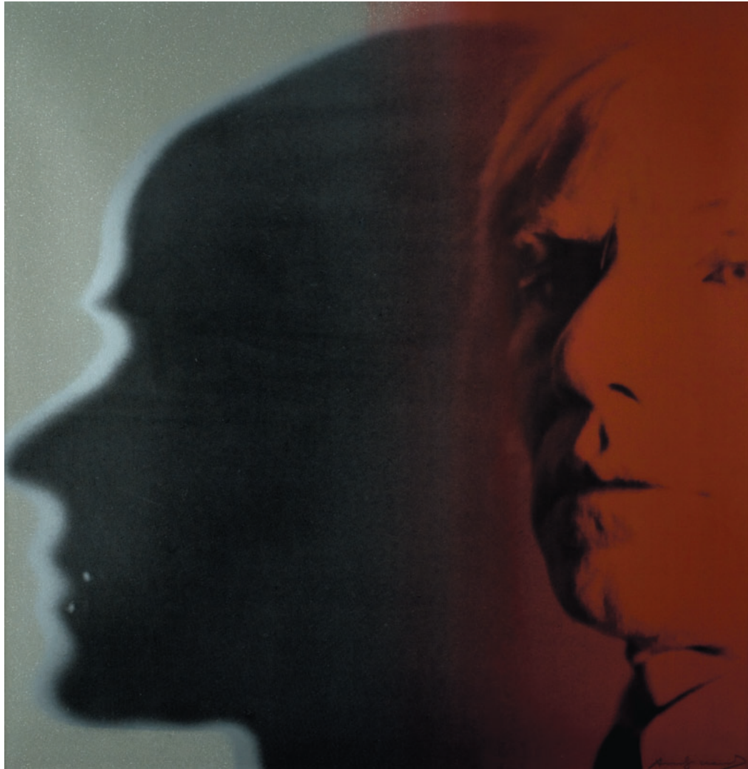
Andy Warhol American (1928–1987) The Shadow from Myths series, 1981 (detail) Screenprint on Lenox Museum Board David and Susan Goode Collection

The exhibition also features another type of print called the screenprint. Artists adapted this common commercial method, used to apply words and images to paper, to create dynamic and bold designs. Pop artists such as David Hockney, Wayne Thiebaud, and Andy Warhol have used this technique to make stimulating graphic works.