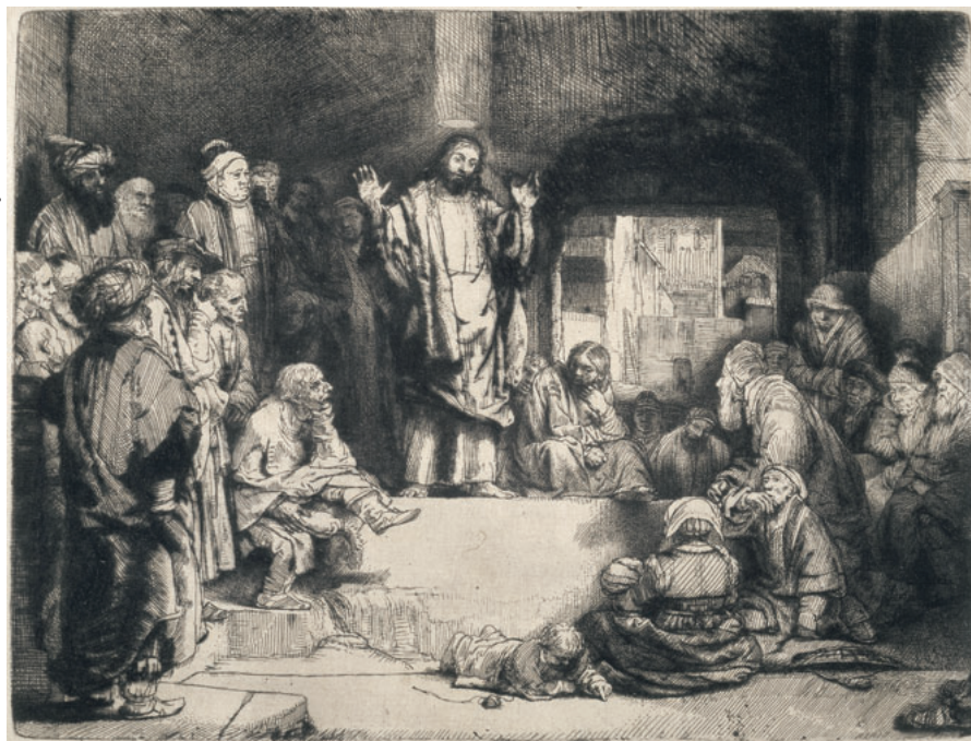
Rembrandt Harmensz. van Rijn (Dutch, 1606–1669) Christ Preaching , ca. 1652