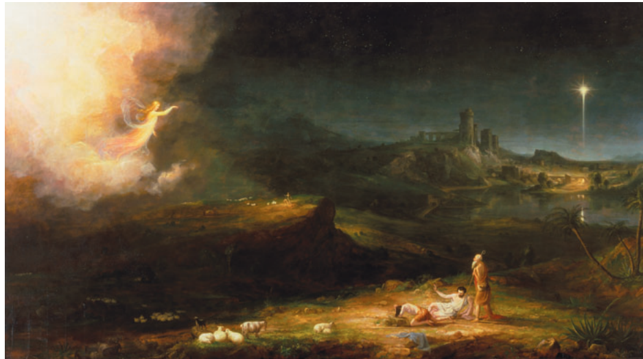
Thomas Cole (American, 1801–1848)

The Angel Appearing to the Shepherds, 1833–34