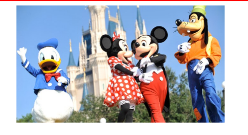
Mandatory Disney Parent & Student Traveler Meeting on Wednesday, January 21 @ 6:00 pm at the Upper Campus. The February 11-14 itinerary and expectations will be reviewed.

in the Multi Purpose Room. Please see Page 5 for more information.