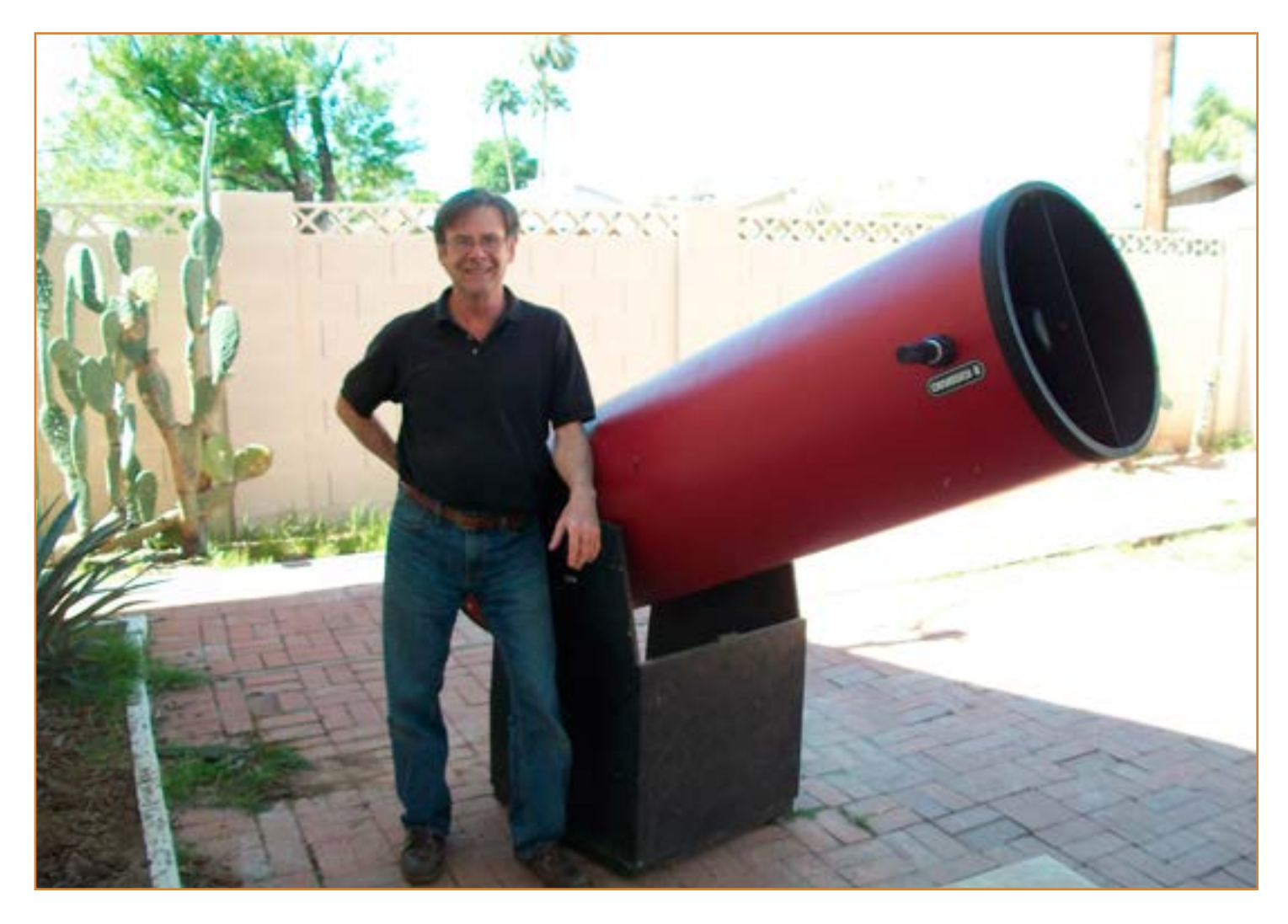
Dobsonian Telescope For Sale

In April of 1992 I bought a dobsonian telescope with a 17.5" mirror from Coulter Optical. They are no longer in business. I paid $1239.13 for the telescope. (Tax incl.) I have enjoyed using it but no longer have the means to transport it to a dark sky. The telescope needs to be used by someone who can get full use out of it so I am ready to bid farewell. I have the original operating guide. Some of the specifications are as follows: