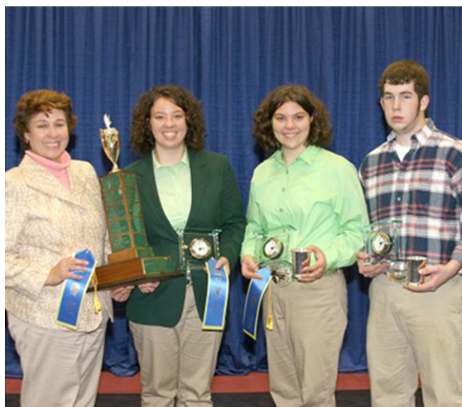
2007 National 4-H Skillathon Contest in Kentucky

My 4-H career spanned nearly every conceivable event and team. I sewed, judged livestock, went to 4-H camp, learned to safely shoot BB guns, cured country hams, attended national conferences, and gave speeches. Dipping my toe into so many disciplines definitely made me a more well-rounded student, but my heart lied in the livestock program, specifically in Skillathon. I enjoyed that part of the livestock competitions the most because you relied solely on your ability and knowledge of animal science. Ten years of work and study culminated at the 2007 National 4-H Skillathon Contest in Louisville, Kentucky. My sister and I were on our county team (not to mention coached by our mother!) representing Kentucky 4-H and to our delight won the National Contest! This remains my proudest accomplishment as a 4-H member.