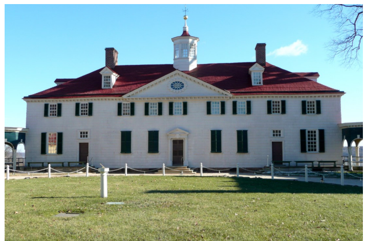
Mount Vernon, George Washington's Home

Overall Citizenship Washington Focus is a great experience and I encourage high-school aged 4-Hers to attend it. This experience will enhance your understanding of current issues and events and help you see and appreciate other viewpoints that will challenge you to form your own opinions and contribute more to your community and country. To be able to attend CWF, you must first apply (applications found on the UW-Extension website) in September and go through and interview process before finding out if you have been selected for the experience. I fully endorse the Citizenship Washington Focus trip, and hope that many more youth from our county will have the opportunity to go on this trip and come back as better individuals ready to make a difference in their community.