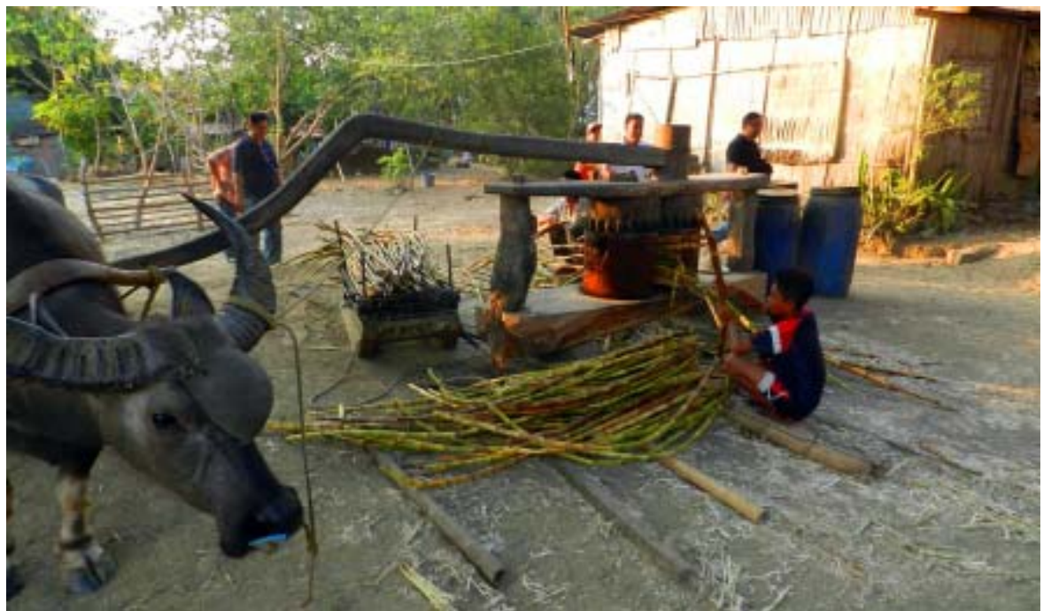
MESA a dadapilan idiy Ilocos Sur.

Awanen ti anawang. Adda pay met ketdi a nabati ti dua a dadakkel nga akasia [algarroba] kadagiti lima a kapuon idi pumanawak iti Tapao kadagiti panawen ti 1966 a panagbariw-as. Kalkalpas idi ti