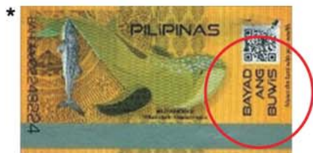
Nababa nga buwis ti sigarilyo

Amin nga kaha iti sigarilyo ket masapul nga adda selyo na manipud Abril 1, 2015 kas annureten iti regulasyon iti BIR no. 7-2014