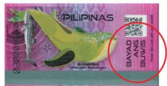
Nangato nga buwis ti sigarilyo