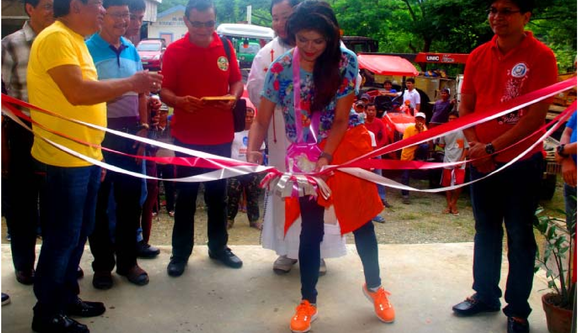
DEPARTMENT of Agriculture Secretary Proceso Alcala and Ilocos Norte Governor Imee Marcos lead the ceremonial ribbon cutting for the formal turn-over of the P16 million Agri-Pinoy Rice Processing Complex to the farmers' association in Piddig meant to promote agri-business and boost farmers' productivity by taking advantage of the value chain.