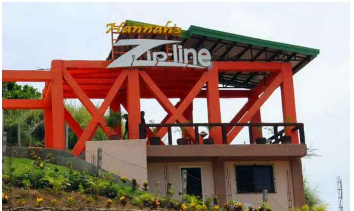
Hannah's Zipline: the world's longest