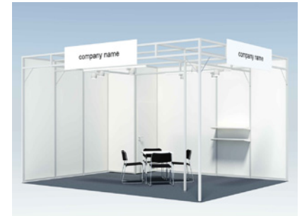
Furniture Package C (standard)