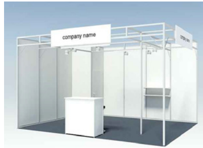
Furniture Package B