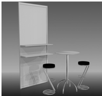
Furniture Package A