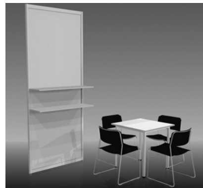
Furniture Package C