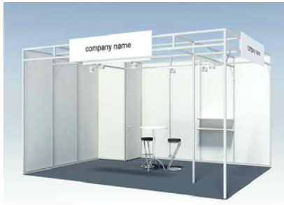
Furniture Package A