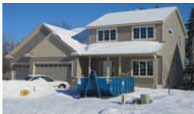
5722 Oregon Ct

In 2010, thirteen lots were sold and a new house was built on each. All of these houses have been sold.