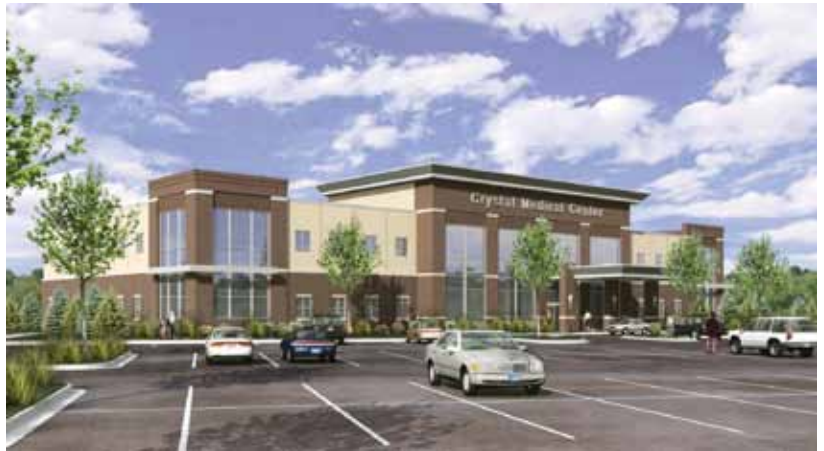
Proposed medical clinic at 5700 Bottineau Blvd.

A private developer has submitted site and building plans for a new $12 million, 43,000 sq. ft. medical clinic to be located on the east side of Bottineau Boulevard south of Airport Road. The clinic would be accessed from the new “backage road” being built by Hennepin County as part of its County Road 81 reconstruction project. The clinic would provide Northwest Family Physicians with a new, state-of-the-art facility for their practice plus additional space for other medical tenants. The developer is purchasing approximately half of the 4 acre site from Hennepin County through the Crystal EDA. For the other half, the developer has negotiated voluntary purchase agreements with private property own-