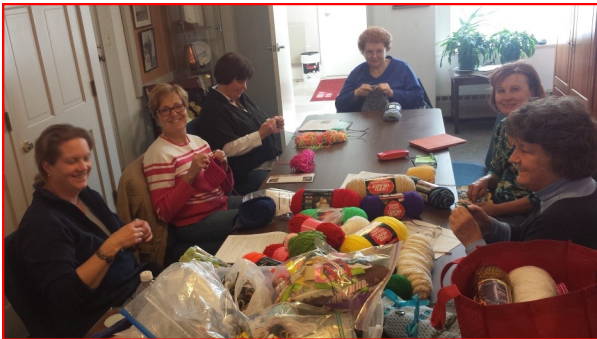
Pictured here at the Wednesday morning crochet group are (L-R):