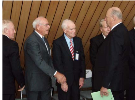
Alfred and the King