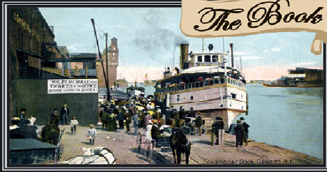
Steamer 'Arundell' takes on passengers in Oswego.