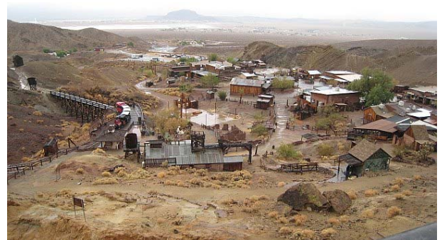
Calico Ghost Town. Camp area can be seen at top left, and the mining train on the left. We hope it won't be raining, like the day we visited, but we had a good time anyway.

We will be camping within the park area, within walking distance of the ghost town attractions. We will have a large tent area at the end of a loop, three adjacent RV spaces with full hookups, and four spaces without hookups. Overflow parking is nearby. Maximum RV length is 41 feet for all sites. Water and dump stations are available for RVs without hookups. There are hot showers and flush toilets nearby. There are heated cabins available nearby, if you don't fancy tenting (reserve at www.sbcountyparks.com ) .