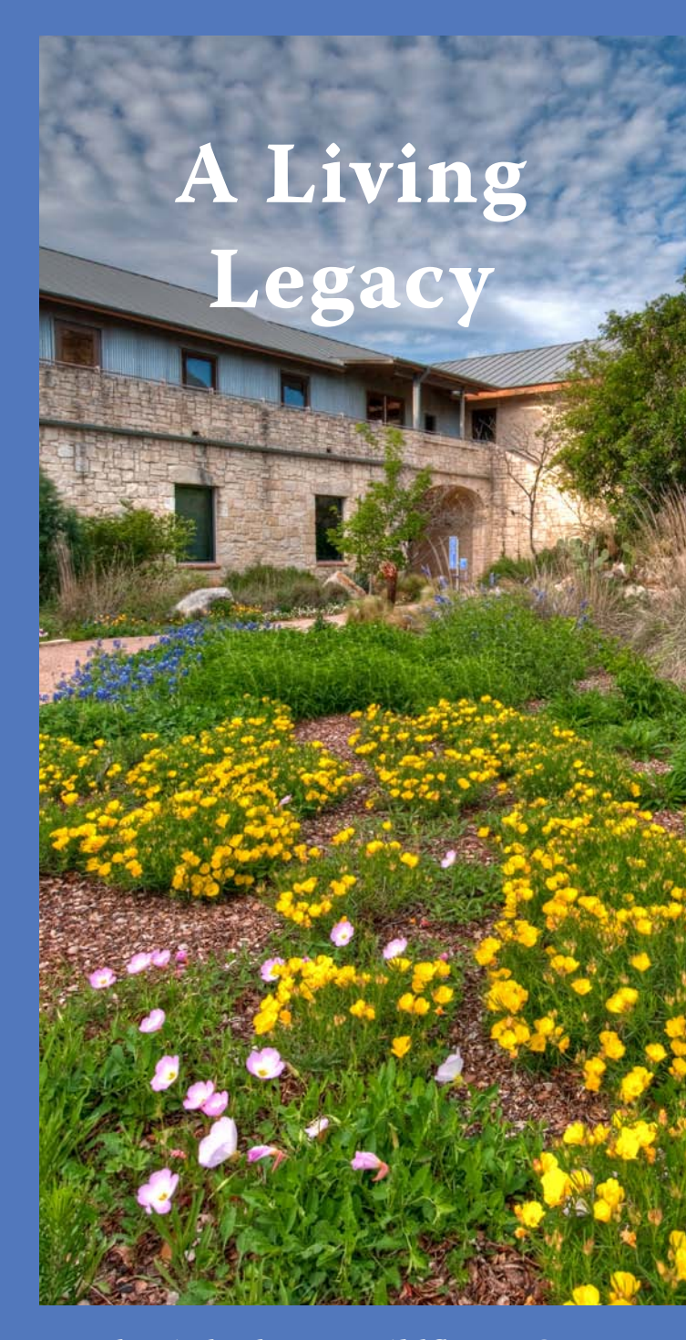
Lady Bird Johnson Wildflower Center