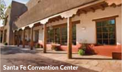
Santa Fe Convention Center