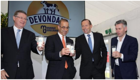
Tony Abbott at the Devondale Murray Goulburn Processing Facilities, July 2014.