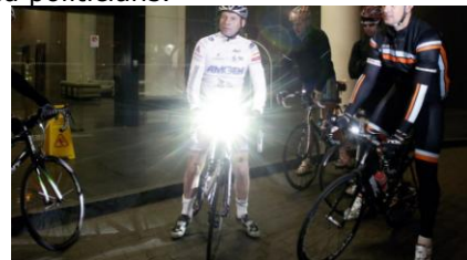
Tony Abbott sets off on an early morning ride in Brisbane, August 2013.

Abbott believed in a liberty of rules with freedom restrained and protected by the state. He doesn't celebrate free spirits except, rather touchingly, those who ride bikes: "The bike is a freedom machine." And he finds repugnant the idea of having a bill of rights to guarantee our liberties. He is not alone there on either side of the House of Representatives. Politicians look after themselves. Their instincts are finely honed. As Abbott told Laurie Oakes one night in 2008: "The problem with a bill of rights is that it takes power off the elected politicians."