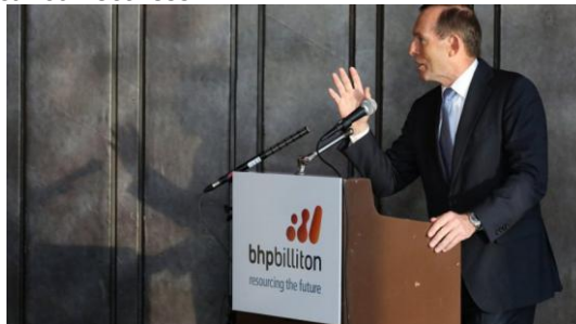
Tony Abbott addresses the Petroleum Club in Houston, Texas, June 2014.

and Brandis for swiftly promising to fix the act. "It signals a new cultural attack on Labor on grounds of political correctness."