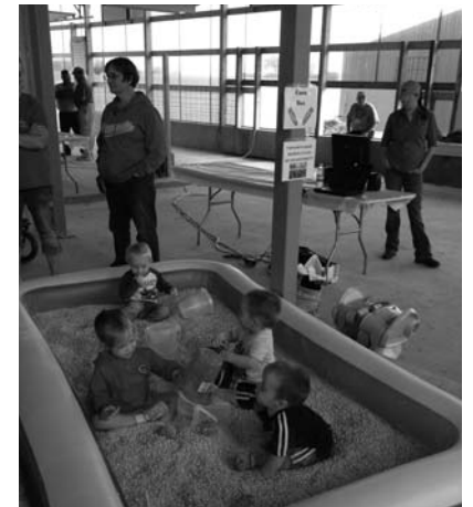
A big hit with the smaller children was the corn box.

Thank you to the Pierce County Dairy Promotion Committee, Pierce County Farm Bureau and Wisconsin Milk Marketing Board for sponsoring this event.