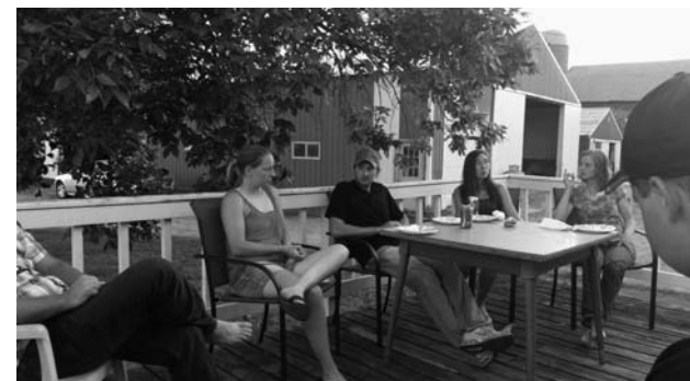
YFA members enjoyed good weather, good food and good conversation at the District 9 YFA BBQ.

For more information about YFA events in District 9, please contact Cindy Bourget at 715.505.7676.