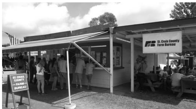
Many fair goers visited the St. Croix County Farm Bureau food stand.