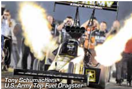
Tony Schumacher U.S. Army Top Fuel Dragster