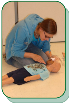
Learn rescue breathing skills