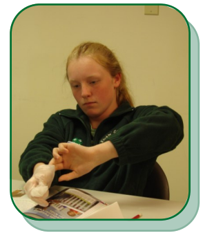
Learn basic first aid

This class usually costs $95, and is being underwritten by a grant !