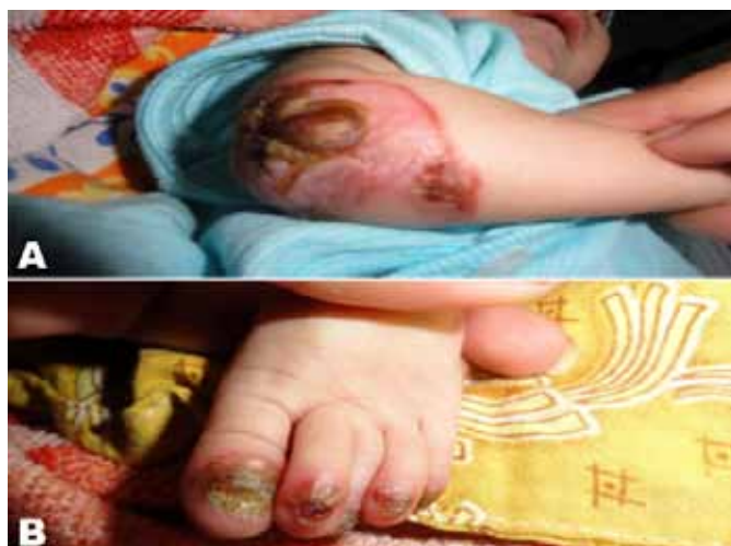
Figure 1 (A, B): Clinical image showing dystrophic toe nails and scarring and disfigurement over the right elbow.

The neonate developed fluid filled bullae over both elbows and gluteal region on the fourth day of life. Basic interventions such as intravenous cannulation provoked blistering. The bullous lesions subsequently spread all over the body and healed by scarring (Figure 1A). However, there was no mucosal involvement. Hence, EB was diagnosed and the dystrophic variety was considered in view of extensive scarring and dystrophic nails (Figure 1B). The neonate was discharged with topical emollients, skin protective measures and nutritional supplements for catch up growth. The infant had good weight gain, and was thriving well till four months, despite frequent blistering episodes and scarring. Frequent scarring had lead to stiffening of fingers and toes. Though the skin biopsy could not be performed due to the financial