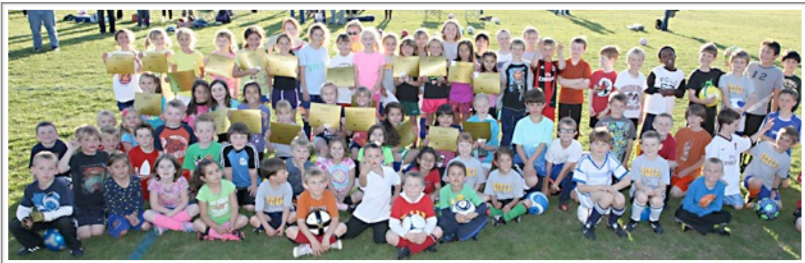
Rio Rapids SC Youth Academy