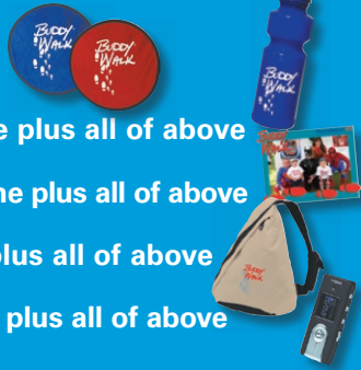
Photos for illustration purposes only