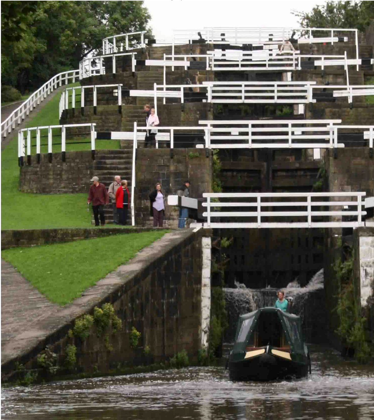
Bingley Five Rise