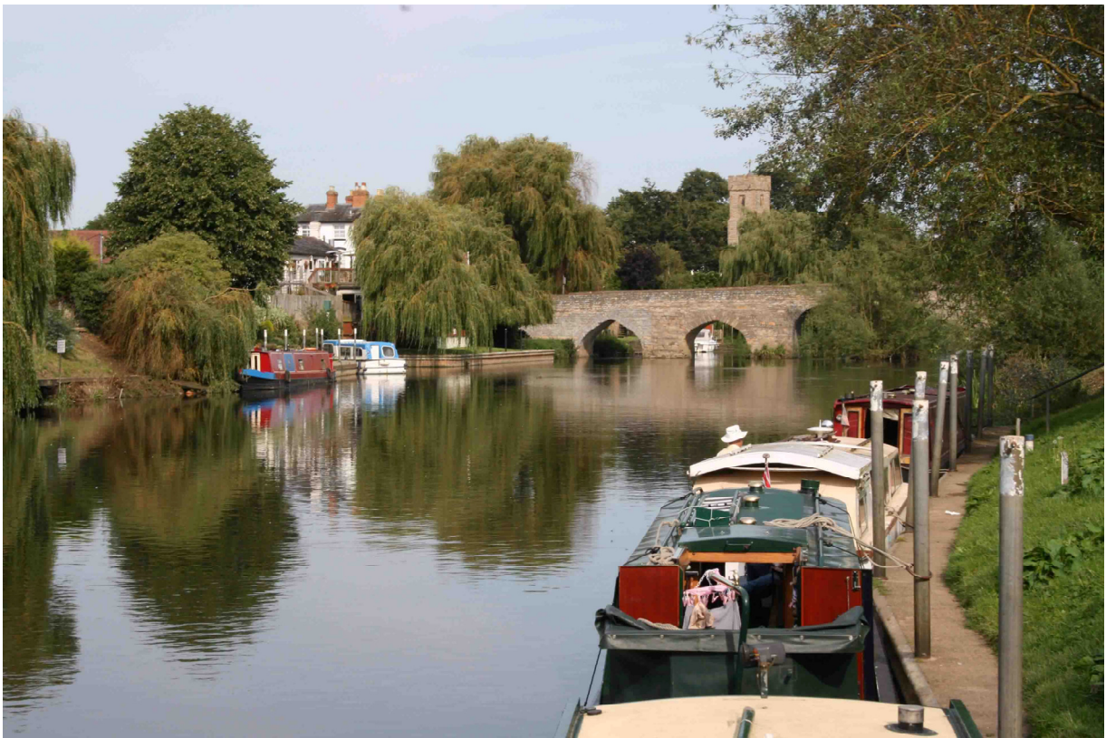
Bidford on Avon

Canal House, Applecross Street, Glasgow, G4 9SP, Tel: 0141 332 6936