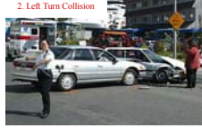
2. Left Turn Collision