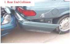
1. Rear End Collision