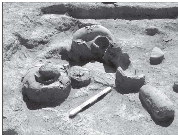
Collection of complete ceramic vessels from house floor at the Richter site, AZ AA:12:252 (ASM).