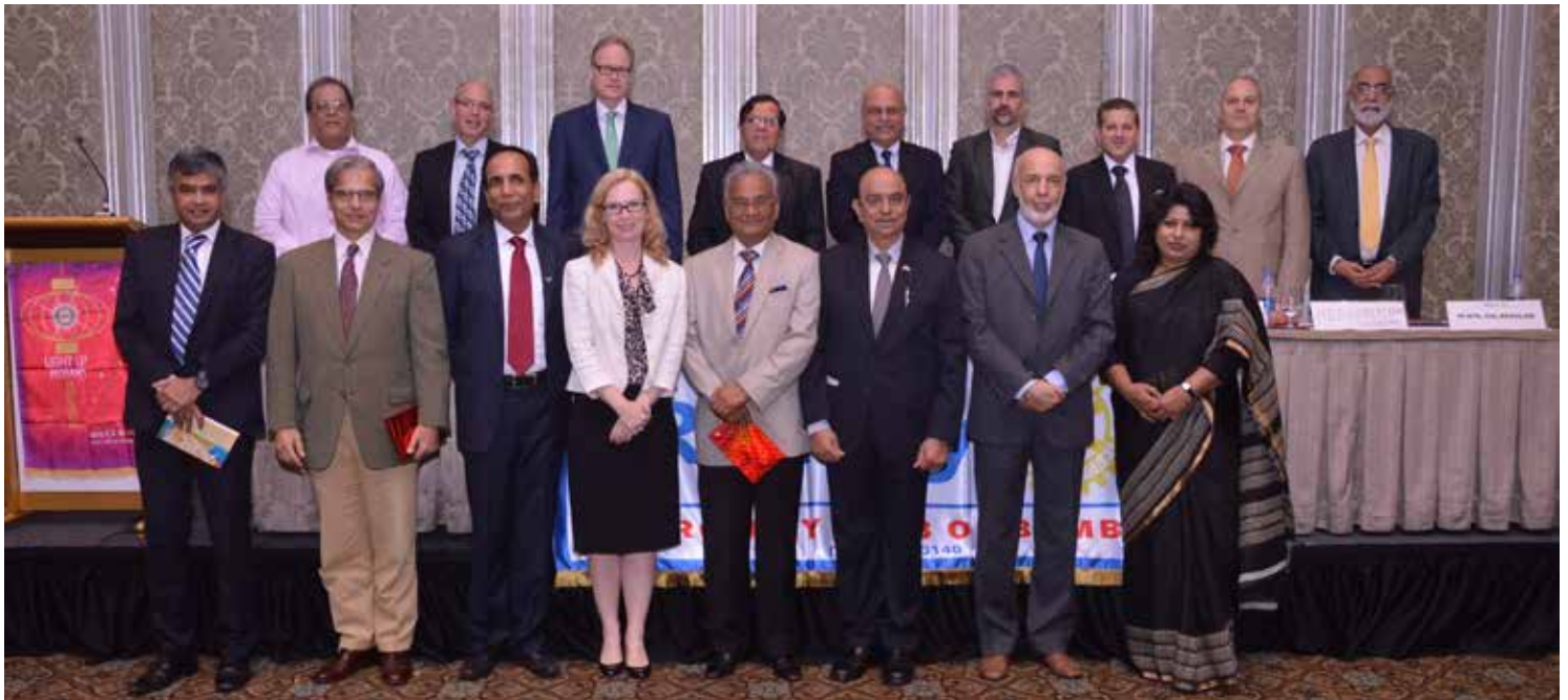
The Consuls General on the panel at last week's meeting

At last week's meeting, the Consular Corps discussed the Prime Minister's global thrust and its impact on the State