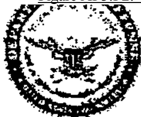
Figure AP3.F2. Wallet Size (DD Form 1826-1, Front and Back Sides)