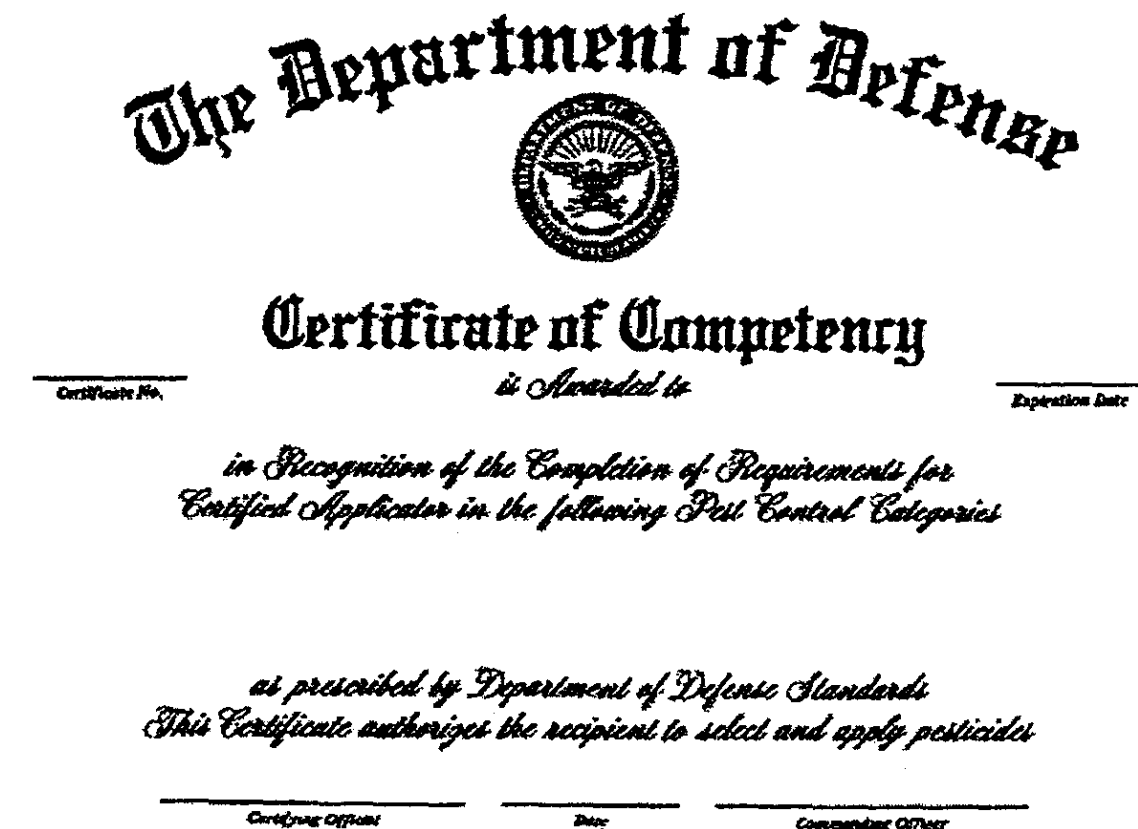
Figure AP3.F1. Page Size (DD Form 1826)