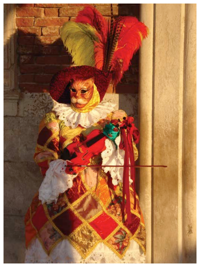
Carnevale reveler, photo by Ellen Renstrom.