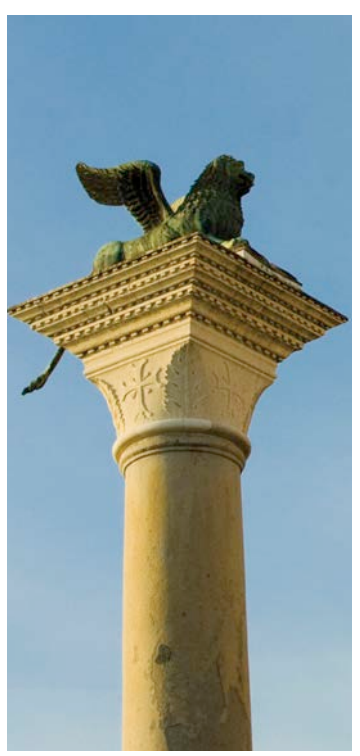
Carnevale mask (top left), Torre dell' Orologio (above left) and The Lion of Venice (above).