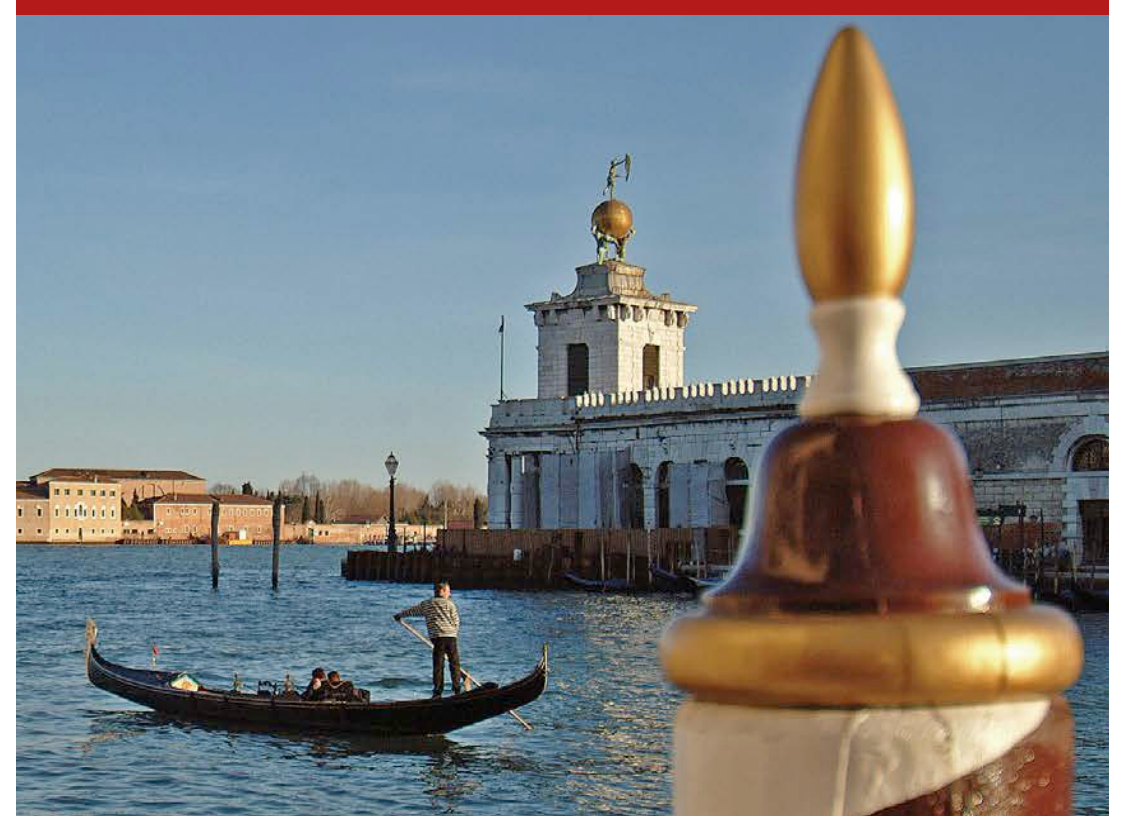
On the front cover: Carnevale ladies. Above: The Grand Canal.

EXPLORE THE HISTORY OF THE PRE-LENTEN FESTIVAL OF CARNEVALE , CELEBRATED SINCE AT LEAST THE 15TH CENTURY, DURING THE DAYS LEADING UP TO THE REVELRY. LEARN ABOUT THE ART AND TRADITIONS OF