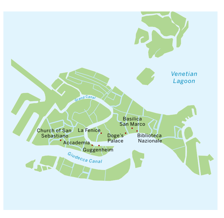
Basilica San Marco (top left), Boxes at La Fenice (center)

Begin the day at the Museo Correr, the museum of the city, whose displays vary from firstrate paintings to objets and costumes. Then see Biblioteca Nazionale Marciana. the Republic's state library, featuring ceilings by Veronese and changing exhibitions of books and images from their vast collection. Following lunch, enjoy a private walking tour guided by a Codega, a costumed character whose history dates from the 15th century, who will introduce us to more of La Serenissima's storied past. In the early evening, depart for the famed La Fenice ("the Phoenix") Theater. Aptly named, this opera house burned to the ground in 1998 — not for the first time - and has now returned to its former glory after years of reconstruction. Tickets can be arranged for the evening performance (pending ticket availability and at an additional cost).