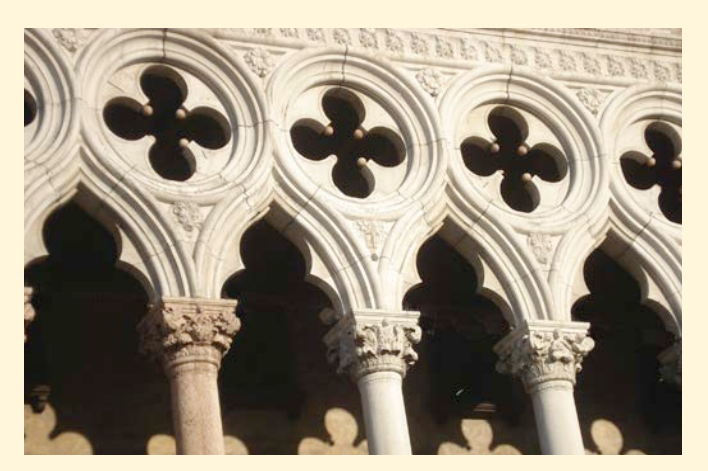
Doges Palace detail (top) and Gondolas and Santa Maria della Salute (above).