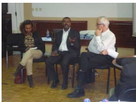
Journalists with Toss Gascoigne in a panel discussion on how the media works in Africa and how to best work with the media