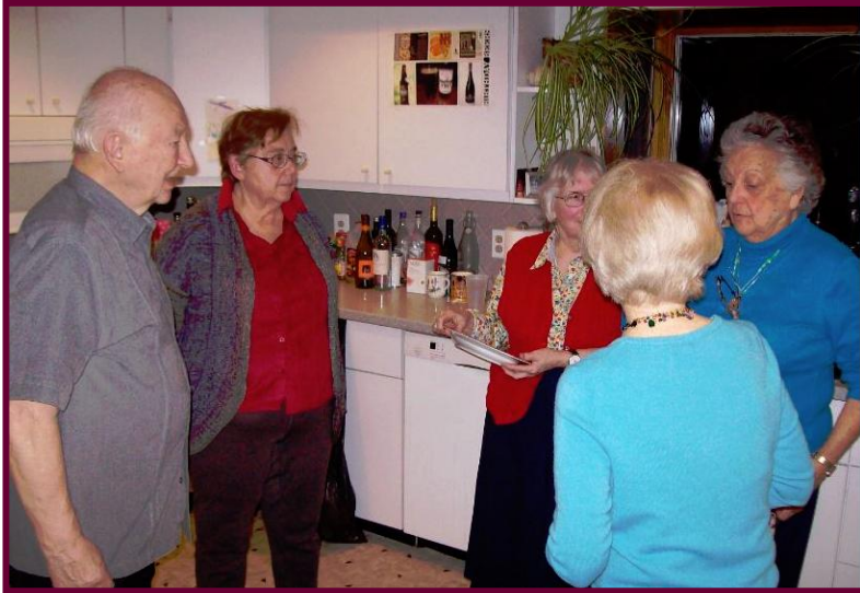
Some of the attendees schmoozing after the main discussion!

We used our annual Holiday Party at the Porters' this year to do the Money in Politics LWVUS update.