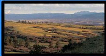
Back Country Wilderness Area of Highlands Ranch