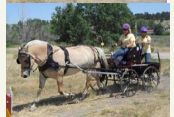
CDS 2013 20 Mile CDT