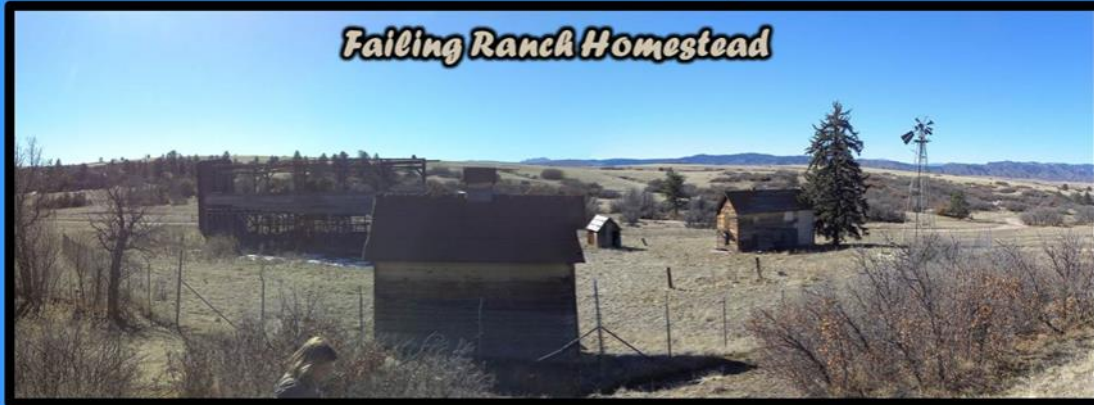
Failing Ranch Homestead

Join us with your carriage or ride along with other CDS members. Take a beautiful scenic leisurely tour of the Failing Ranch Homestead in the wildlife sanctuary of the Backcountry Wilderness Area. This is an exciting opportunity to tour an area not open to the general public. Bring a picnic lunch and enjoy the spectacular views of the Front Range, wildlife and a cozy campfire.