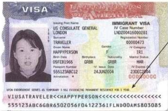
Unexpired Foreign Passport with I-551 Stamp

Upon endorsement serves as temporary I-551 evidencing permanent residence for 1 year.