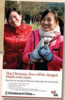
Christmas in China poster