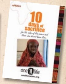
Ten days of sacrifice PDF (Africa)