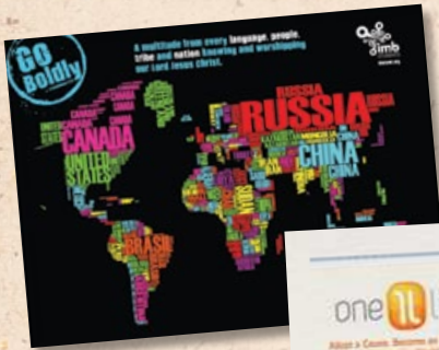
Go Boldly PDF