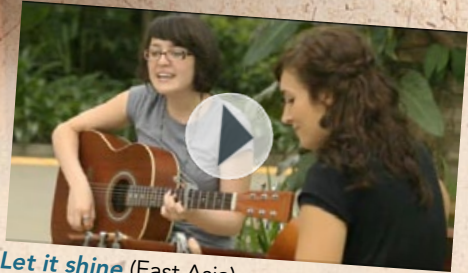
Let it shine (East Asia)