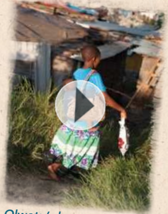
Olwetu's hope (One School - South Africa)