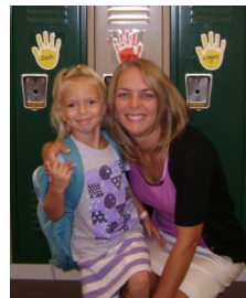
Enjoying the first day of school!