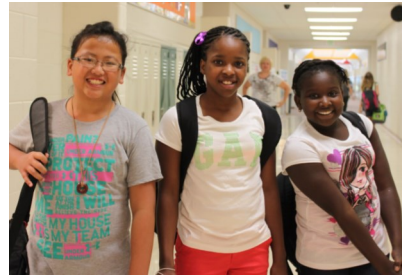
Enjoying the first day of school!