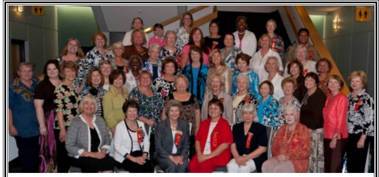
Florida Members at 2010 International Convention

Vol. 56 No.1 Mu State Organization of Key Women Educators Fall 2010