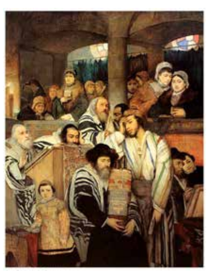
Maurycy Gottlieb. Jews Praying in the Synagogue . 1878. Tel Aviv Museum of Art.