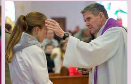
Palms to Ashes —On Thursday, February 12th, participants in our RCIA for Young People program burned palms in preparation for Lent and on Ash Wednesday, ashes from Palm Sunday palms were distributed.