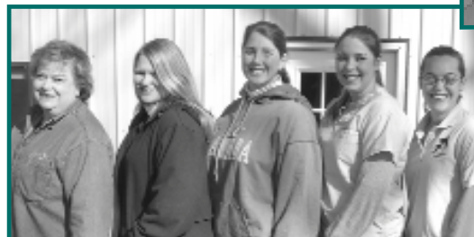
Below: All the behind-the-scenes smiling faces of Equine Medical Associates