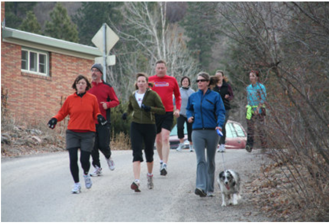
Marathon Training Group, Running Down Jackson Street