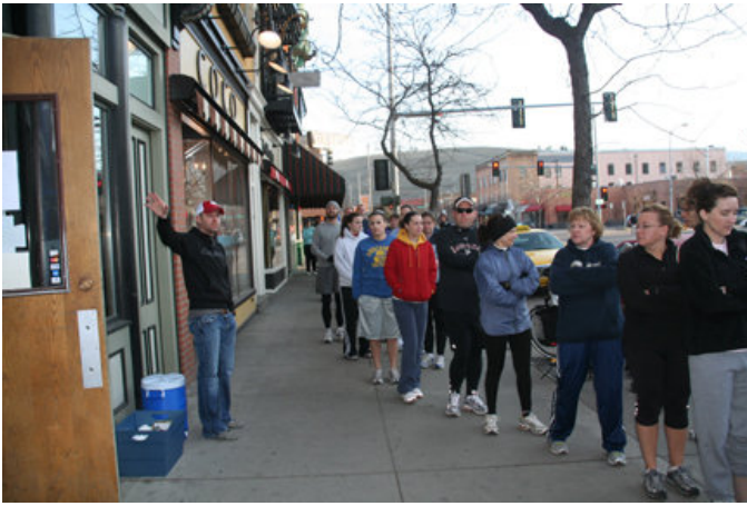
First Day, Marathon Training Sign-up