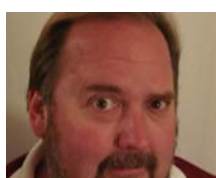
SPOILER ALERT: Commander Santa revealed