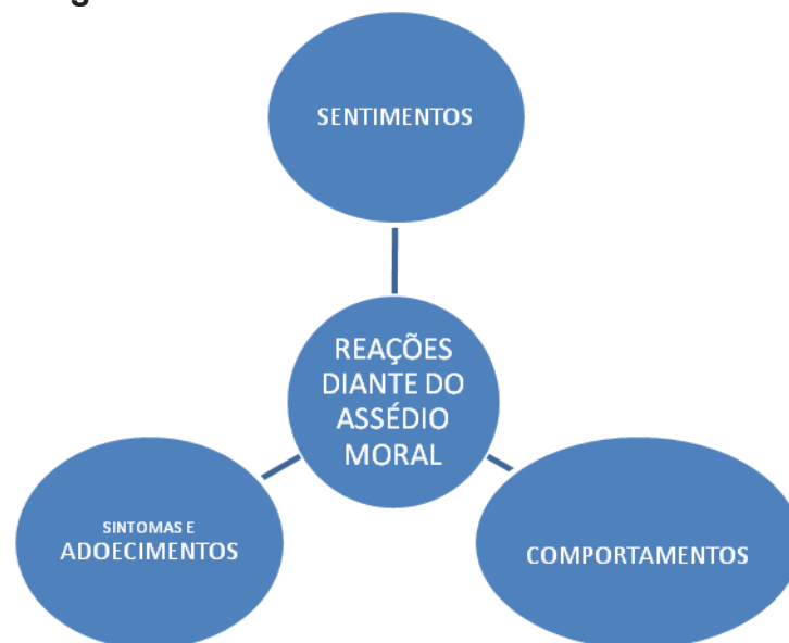
Figure 03: the Moral Harassment Reactions

In Figure 03 below , presents the reactions of bullying .