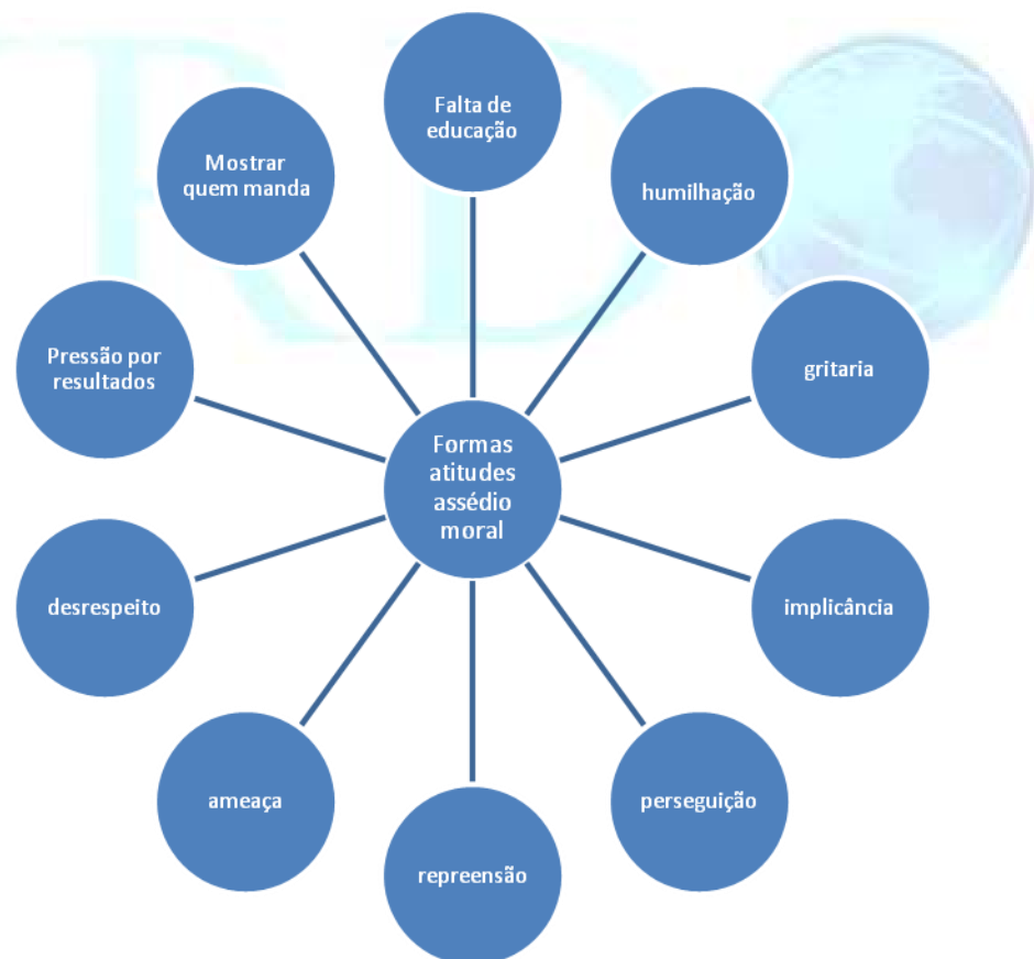
Figure 1: Bullying Attitudes

To be characterized bullying there is some stalker following attitudes: