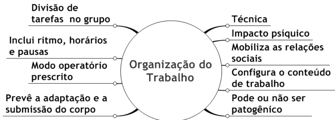
Figure 2 : Work organization Components