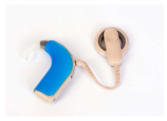
Cochlear implants were found to improve the cognitive function, speech perception and depressive symptoms of older adults with profound hearing loss.