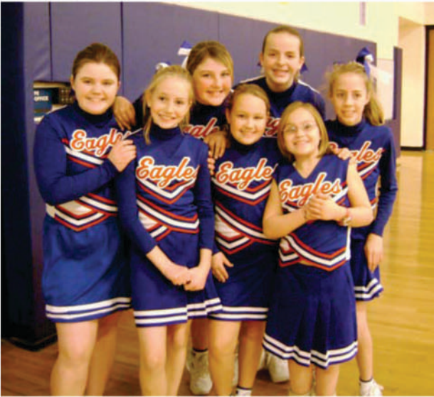
Oak Grove Cheerleaders at the Dec. 19th game.