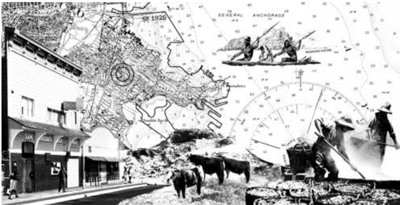
Glass art panel A

The new Bayview Branch Library opened on February 23, 2013. It was designed by THA Architecture of Portland Oregon, and Karin Payson A+D of San Francisco. The construction contractors were KCK Builders, a Bayview-based firm. The cost of the project was approximately $13.5 million. The building was designed to meet Leadership in Energy and Environmental Design (LEED) Gold certification with such green features as a living roof and solar panels. Highlights of the new 9,000 square foot library include public art by Ron Saunders . In addition, Bayview history and culture is depicted in glass art panels that are installed on the sides of the branch.