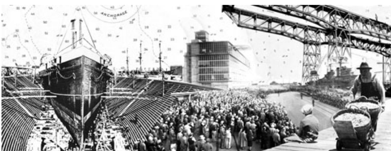
Glass art panel C