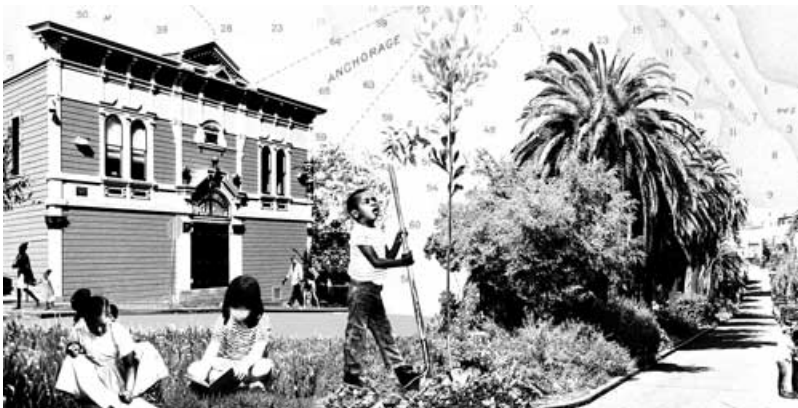
Glass art panel B